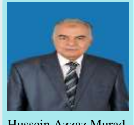
Hussein Azzaz Murad National Research Center, Egypt.