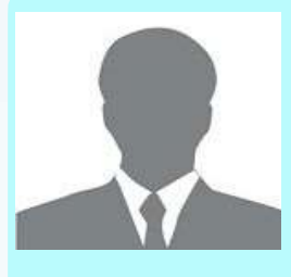
M.A.MARTIN-LENGO Consejo Superior de In- vestigaciones Científicas, Spain